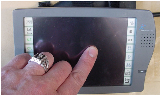
Figure 1: Xybernaut touch screen device

An implementation with auditory soft-buttons was explored in a prototype we developed on a Xybernaut 3 wearable computer. We only used the touch detection on the touch device, not the visual display. See Figure 1, below.